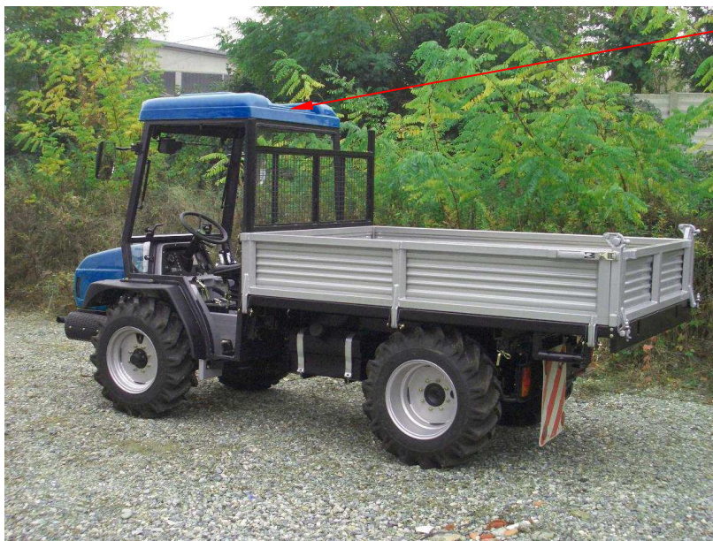
OPEN WINDOW ON THE ROOF