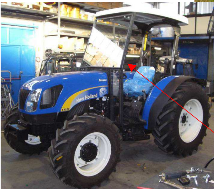
FRONT PART CABIN